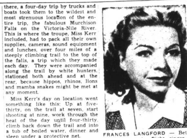
FRANCES LANGFORD - Better known as a top-flight singer of romantic songs, Frances Langford has now turned to dramatic roles and is currently featured in the Lum and Abner picture, "Dreaming Out Loud." She's the love interest, and what a love interest! Of course, she still sings. The producer, cynically figured out that the fans would like that but her role is primarily dramatic. It shows at the Joy-Lan Tuesday and Wednesday.