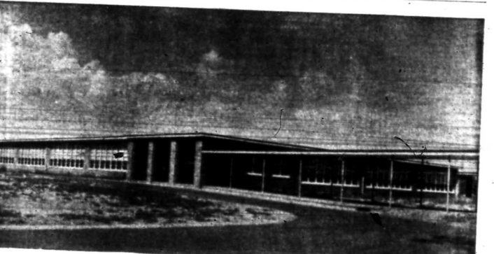
DESHLER JUNIOR HIGH SCHOOL —Completed recently at the Deshler Junior High School cost approximately $110,000, including equipment. It has 10 rooms and a breezeway connects it to the high school and the newly constructed auditorium, band room and cafeteria. This school will accommodate about 300 students.