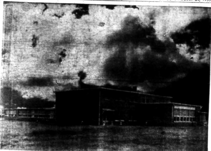
NEW RURAL PLANT EXPANDED —The new Wilson School in Lauderdale County located on the Chatsworth Highway, and completed in 1953 at a cost of approximately $100,000, has undergone further expansion this summer. Due to continued growth in enrollment at this fine rural school it became necessary to add two more classrooms at a cost of about $10,000.